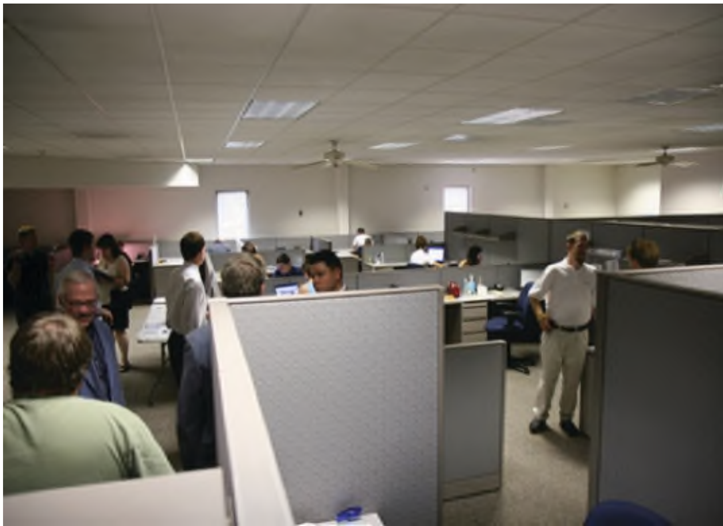
August 8, 2008: Barr - Root 2008 Staff and Volunteers Hard At Work at Campaign Headquarters on Volunteer Day

Office hours: 9 am-6 pm ET New Member Information: Call (800) ELECT-US E-mail: info@lp.org